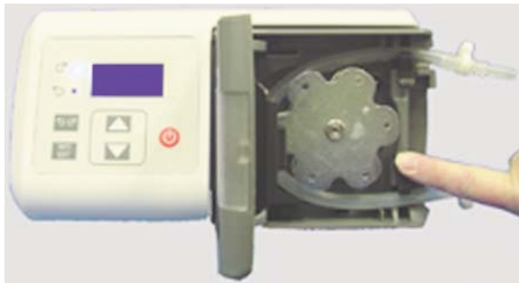
Figure 3-2. Tube Loading Lower Retainer