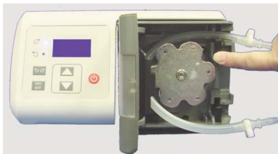
Figure 3-1. Tube Loading Upper Retainer