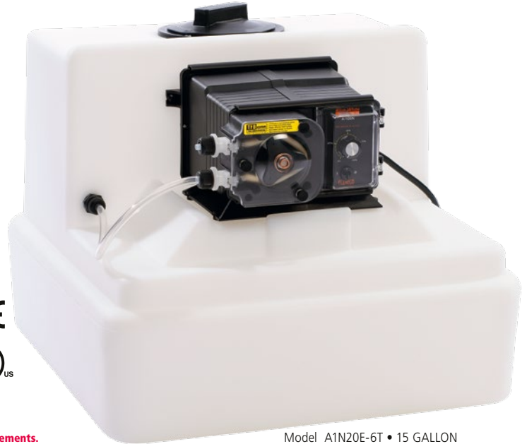
Model A1N20E-6T • 15 GALLON

See model number matrix and parts list drawing on page 18.